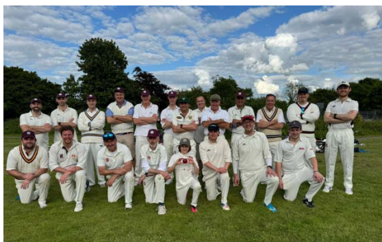
Aynho v Souldern, 16 June 2024

In the 2024 season, the club had 7 fixtures and the current 2025 fixture list (from end May to mid-September) shows an increase in matches to 9, with some 5 home matches and 4 away matches, reflecting the growing interest in both the village and local villages in developing cricket as a community activity for all. The dates for these will be published in the Aynho Parish newsletter or are available from any board member (contact details below). There are also regular net sessions - winter and summer – open to all, to hone your bowling arm or perfect that cover drive.